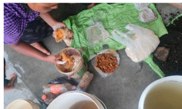
Hand on training on preparation of bio stimulants to shg's members held at mawshynrut block.