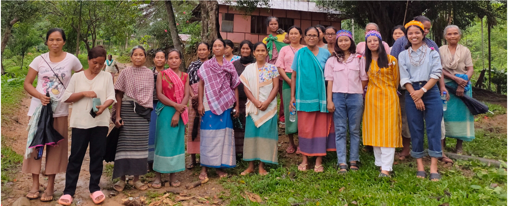
Meeting with the Village Organisation (Tangdoang VO) of Ashugre village under Chockpot Block SGH discussion about marketing their product to EARMACS.