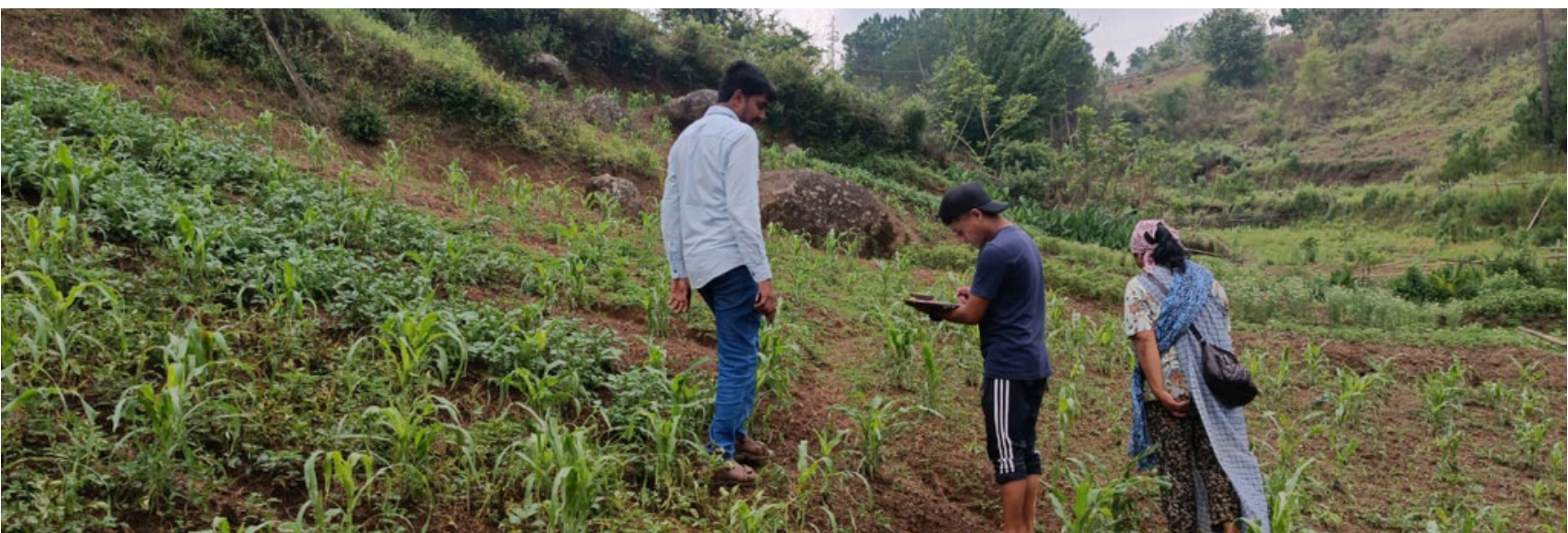
Field inspection conducted by Bio-Resources Development Centre, Regional Council of PGS India organic certification system to farmers practicing natural farming in collaboration with MSRLS at Myriaw Village , Mawthadraishan Block.