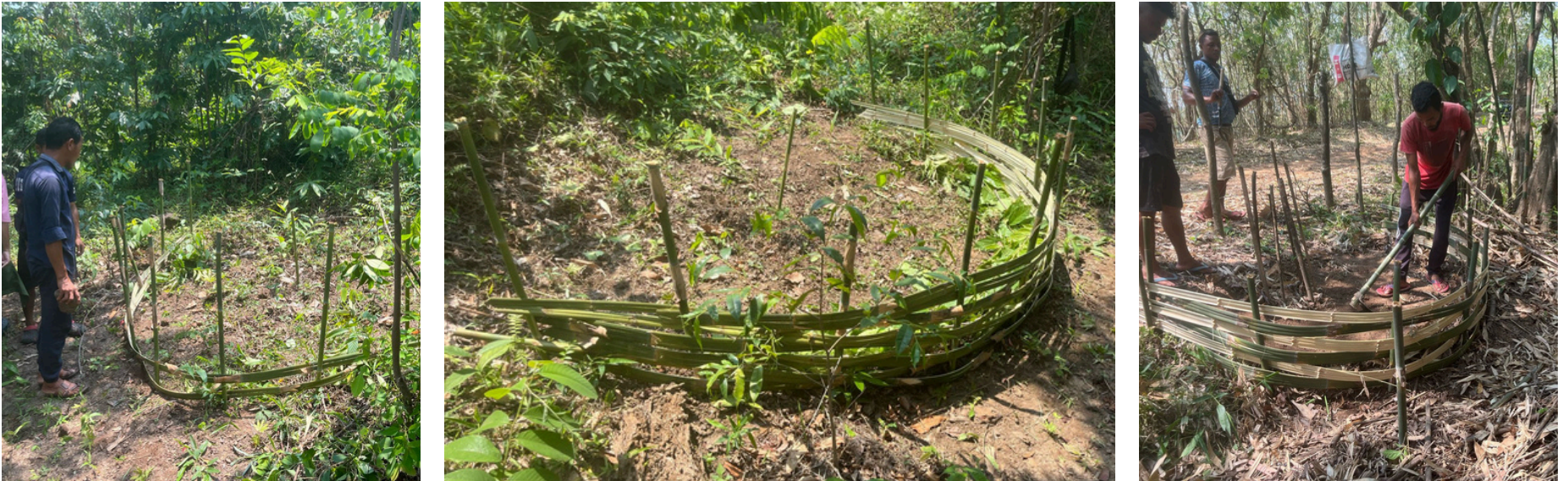
Ongoing halfmoon terracing work in Darengagre and Rangdapara Village, Dalu Block