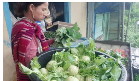
Harvesting of vegetables at Natural farming demo plot at Jongksha village, East khasi hills