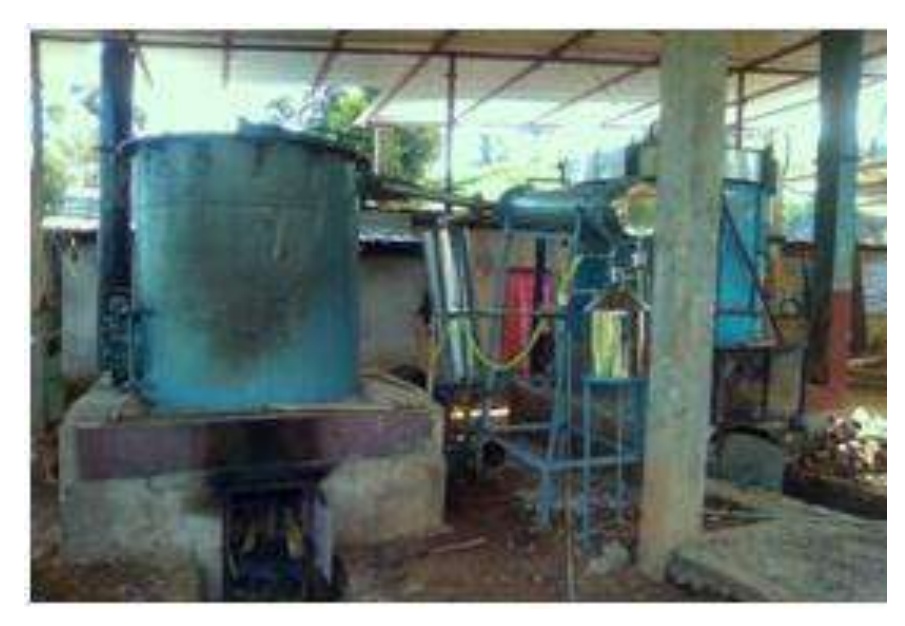
Figure 4: Improved Field Distillation Unit installed at Farmers Field