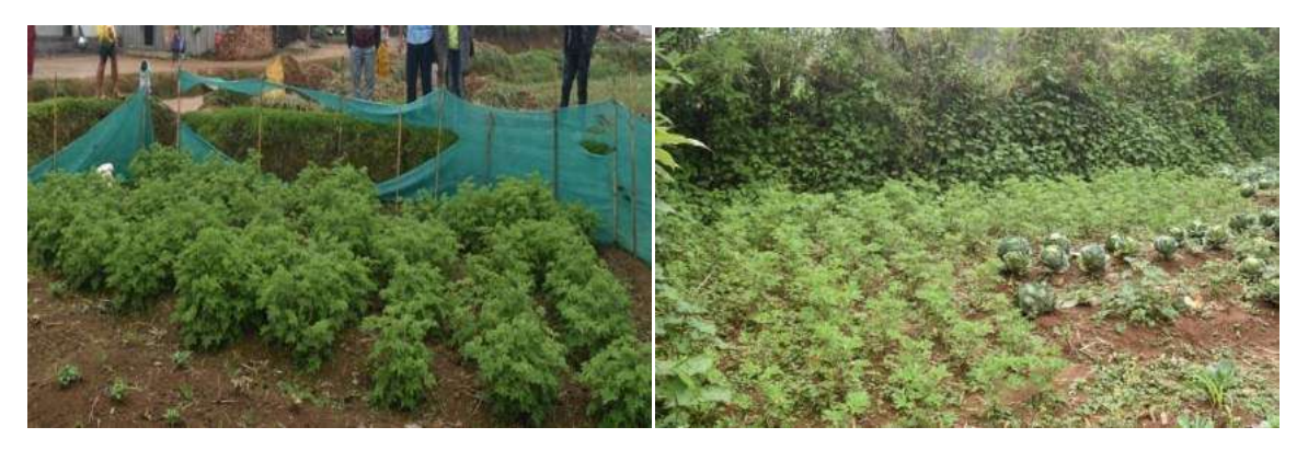
Figure 3: Geranium Nursery in Farmers Field at Cham Cham