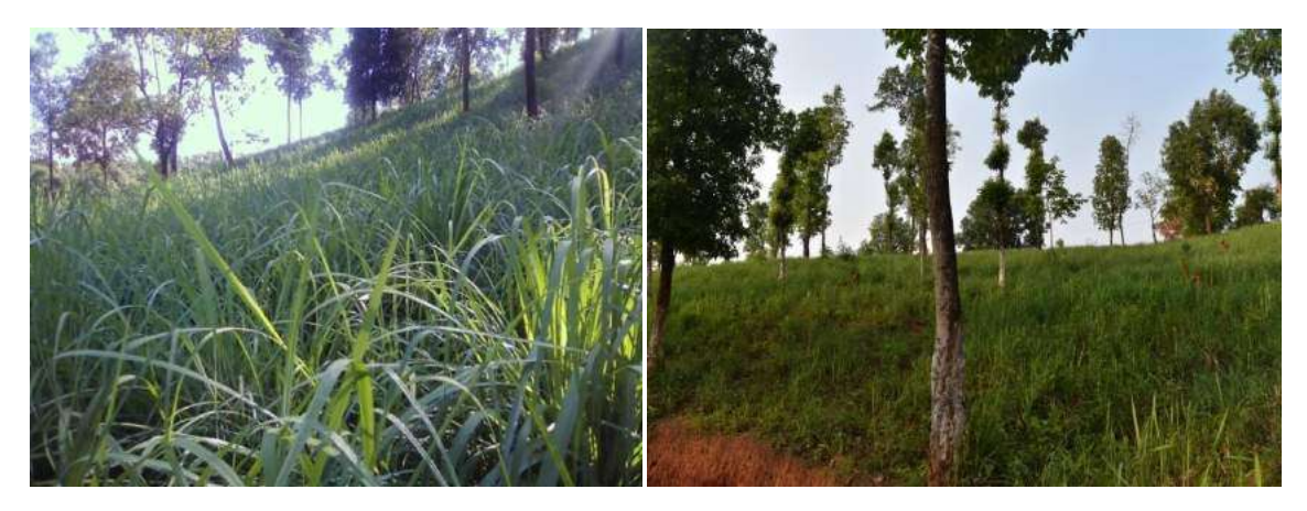
Figure 1: Citronella Plantation at ByrwaFigure 2: Lemongrass Plantation at Byrwa