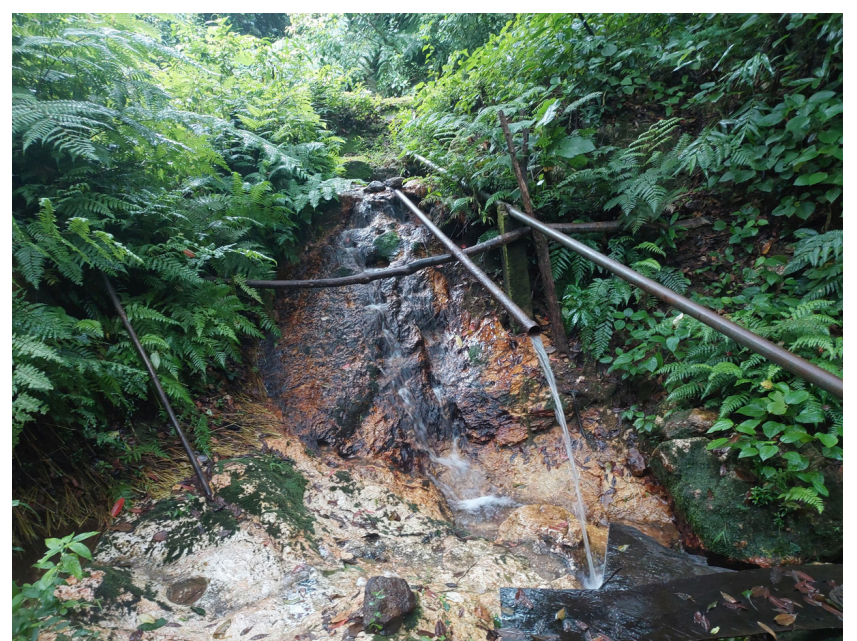
On September 11th, 2024, a spring in Balupara Village, used by 86 households for daily needs, was monitored by the Field Engineer of Ronram Block.