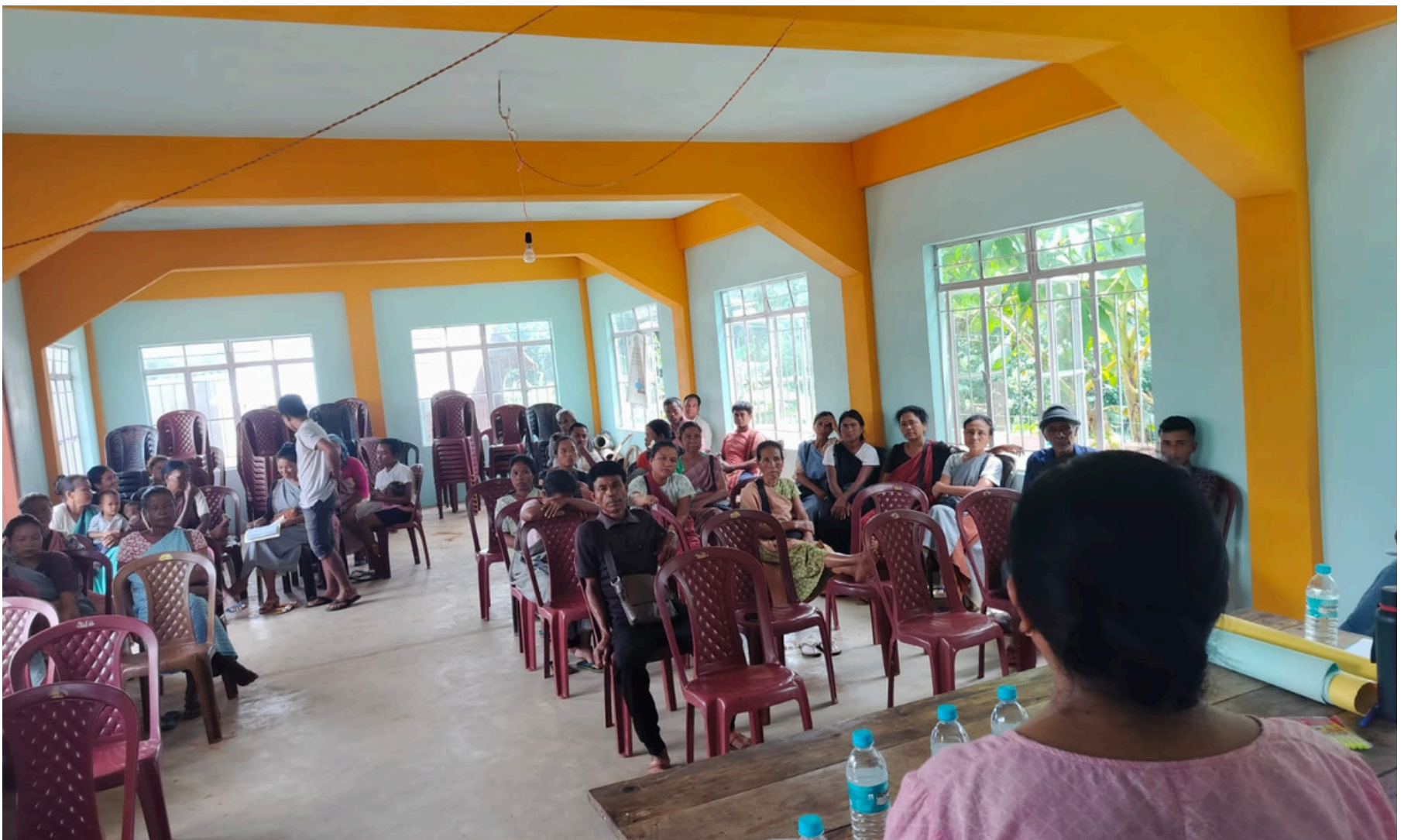
The first day of the PLUP and Microplan exercise for Batch II at Myrdon Mawtari Village, VPIC, took place on September 12th, 2024.