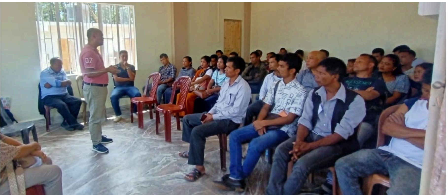
On September 12th, 2024, a meeting was held with the VPIC/VCF of Laskein BPMU at the Laskein C&RD block, in the presence of the DPM and BPMU staff. The purpose of the meeting was to foster confidence and trust to ensure the smooth implementation of all project activities moving forward.