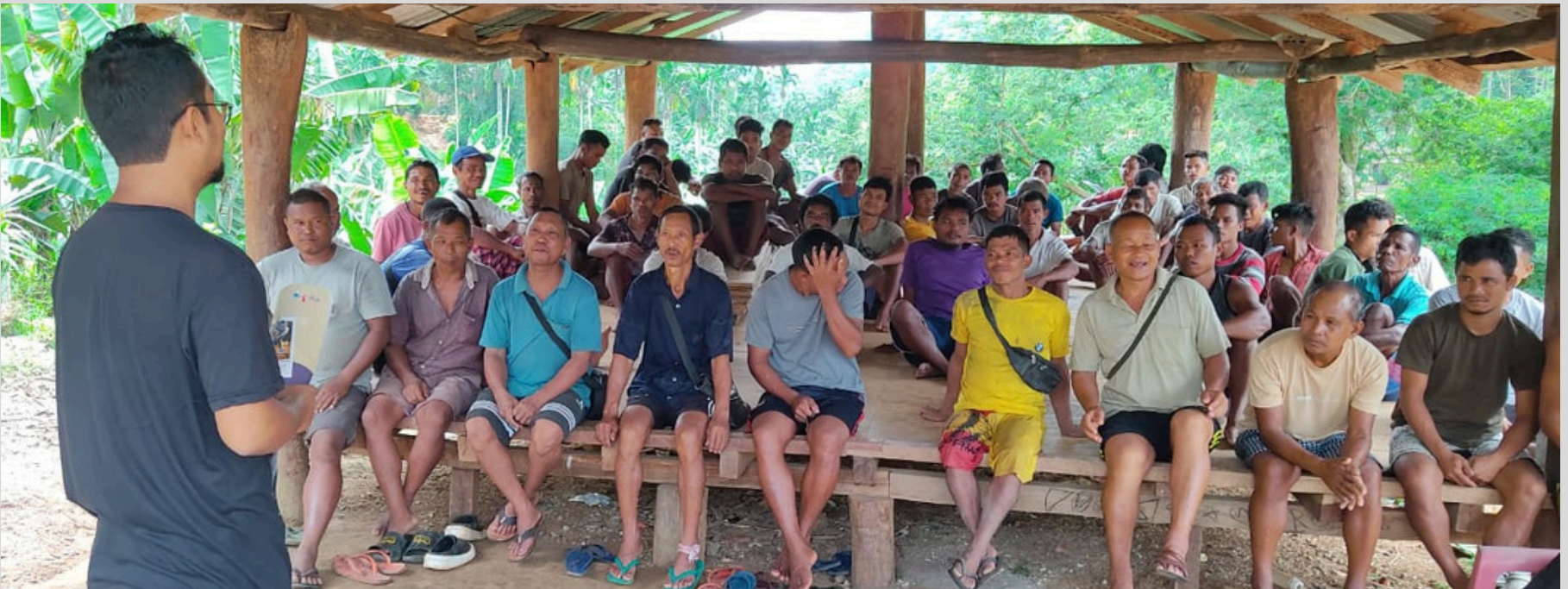
Chachat Abri IVCS IGM.