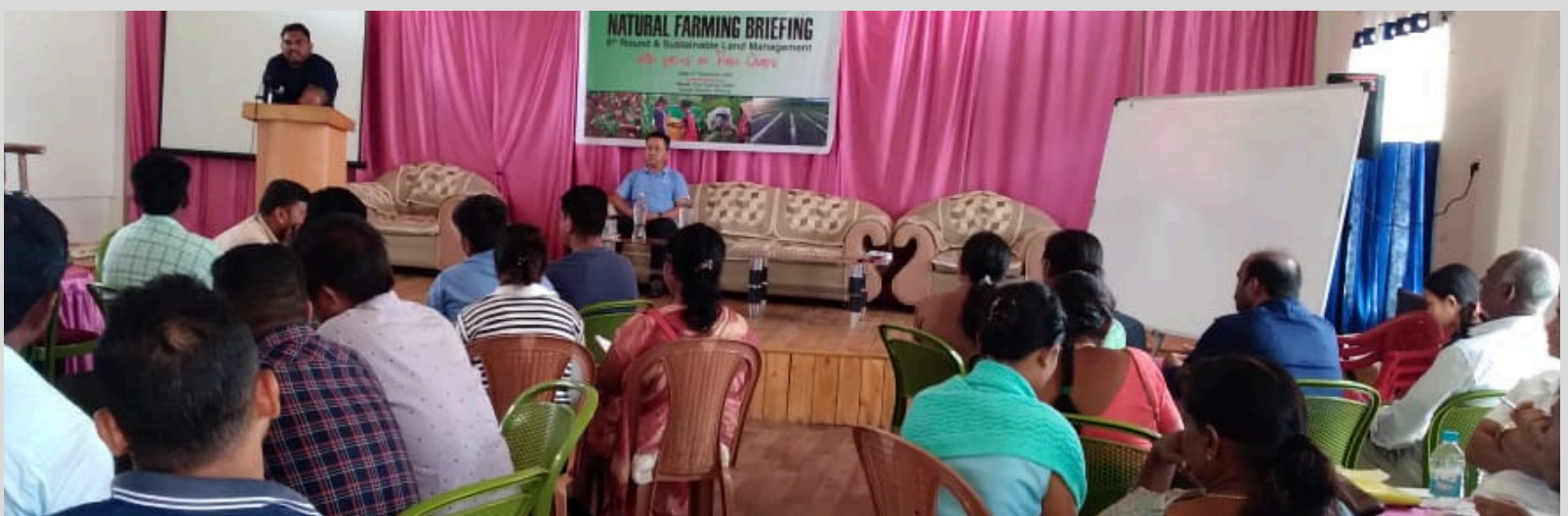
On 6th September 2024, a briefing workshop was held at Toil, Mawlai Mawroh, East Khasi Hills, with block staff and master trainers of MSRLS involved in Natural Farming.