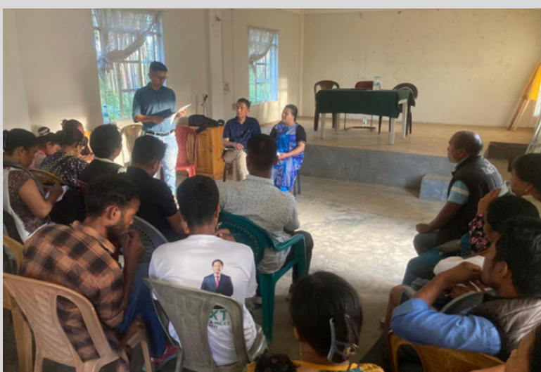
On 6th September 2024, a meeting was held with the Managing Committee members of IVCS in 16 turmeric villages as part of the Traditional to National Program for Organic Production conversion initiative under Sustainable Land Management convergence activities in Laskein Block, West Jaintia Hills. The meeting, attended by the BDO of Laskein C&RD Block and personnel from the District Agriculture and Cooperation departments, covered the Sustainable Land Management project overview, the importance of social agreements, and the work plan for SLM activities.