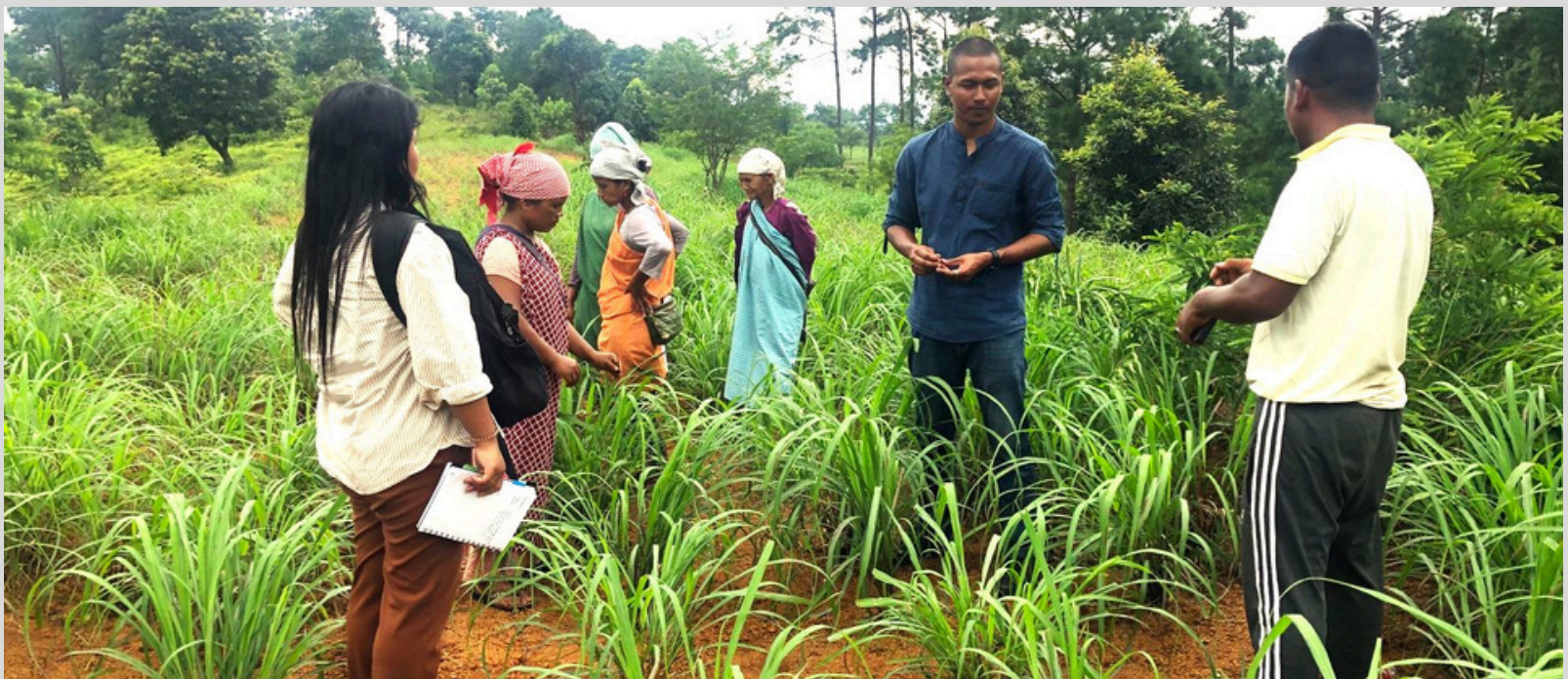
Visit was made on the 5th September 2024 to the ginger cultivation site of the Shiruplang Mynska Group III in Mynska Village under Laskein Block, West Jaintia Hills District by BRDC & MBMA for farmer detail collection and progress inspection. The ginger plantation is thriving in a unique citronella intercropping system. Notably, the semi-shade provided by the citronella is ideal for the ginger's growth, and no pests or diseases were observed affecting the crop